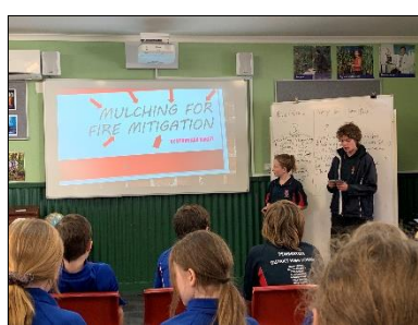
Mulching for Fire Mitigation