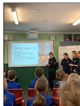
Types of House Fires

This program receives excellent feedback from both school staff and students. Local volunteers and staff deliver the content and activities.