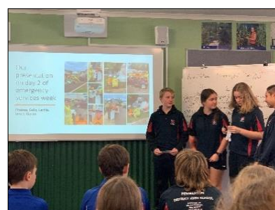
Summary of the Program