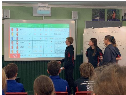
Types of Extinguishers