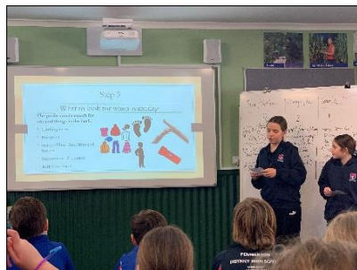
Search and Rescue